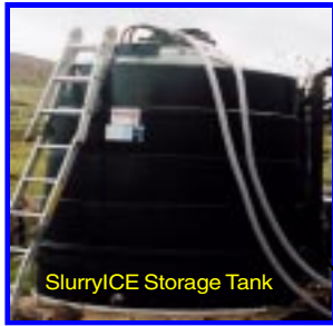
SlurryICE Storage Tank

The installed Prawn Cooling System consists of a 10 kW (3TR) remote condenser SlurryICE machine and an associated 6 m 3 ice storage tank to satisfy a peak load of 47 kW . The ice machine is designed to operate until the tank is full. The energy stored over off-peak periods is later utilised to satisfy the peak loads. Hence, the installed refrigeration machinery is less than 1/4 of an equivalent capacity of a conventional direct cooling system.