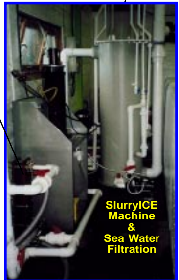
SlurryICE Machine & Sea Water Filtration

The stored energy can be used to operate the process in case of break down or regular maintenance shut downs.