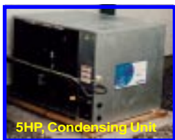
5HP Condensing Unit