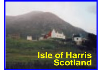
Isle of Harris Scotland

Slurry-ICE is a crystallised water-based ice solution which can be pumped and offers a secondary cooling medium for thermal energy storage while remaining fluid enough to pump. It flows like conventional chilled water whilst providing 5 ~ 6 times the cooling capacity.